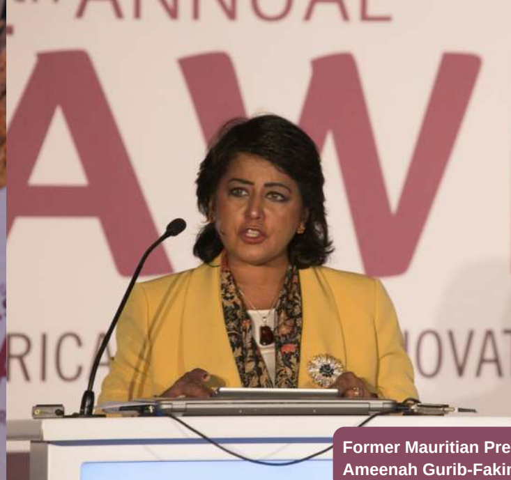
Former Mauritian President Ameenah Gurib-Fakim