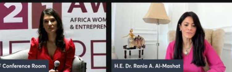
H.E. Dr. Rania A. Al-Mashat