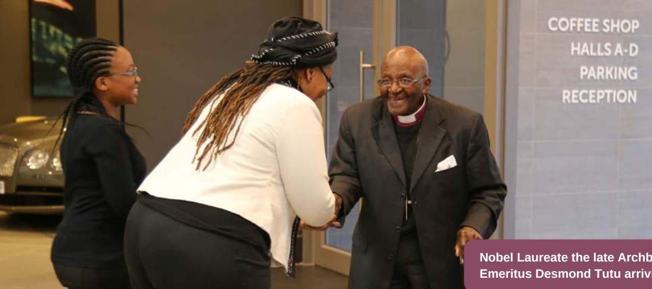
Nobel Laureate the late Archbishop Emeritus Desmond Tutu arriving at AWIEF 2017