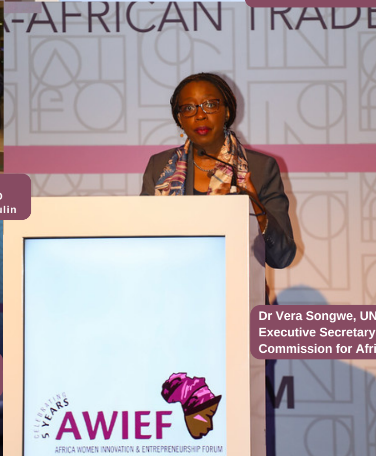
Dr Vera Songwe, UN Under-Secretary General & Executive Secretary, United Nations Economic Commission for Africa (UNECA)