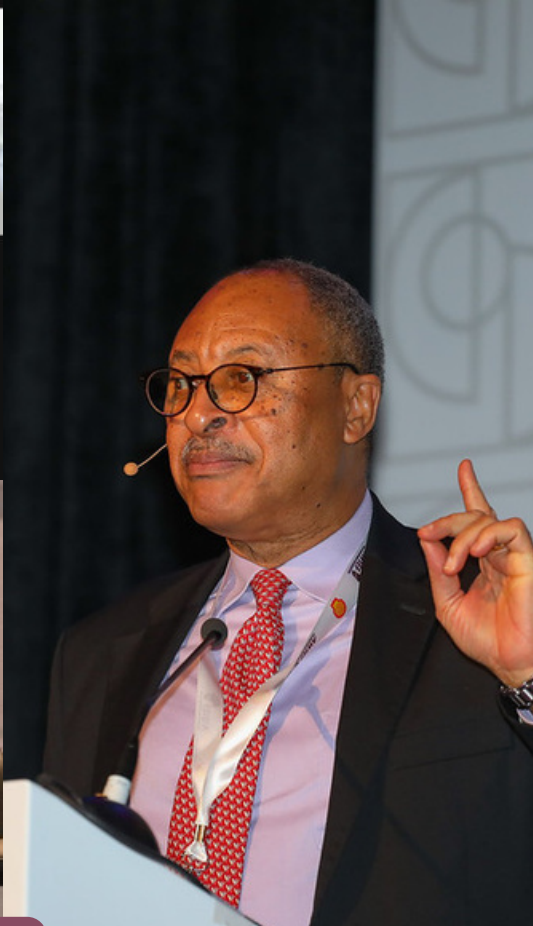
Prof Pat Utomi, Founder of the Centre for Values in Leadership (CVL)